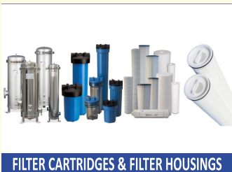
FILTER CARTRIDGES & FILTER HOUSINGS