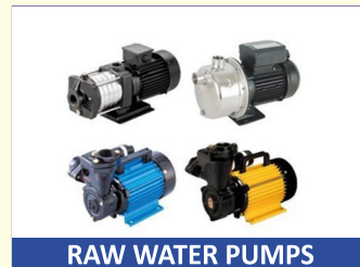
RAW WATER PUMPS