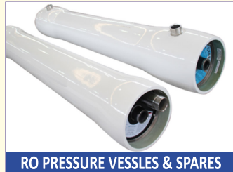
RO PRESSURE VESSELS & SPARES