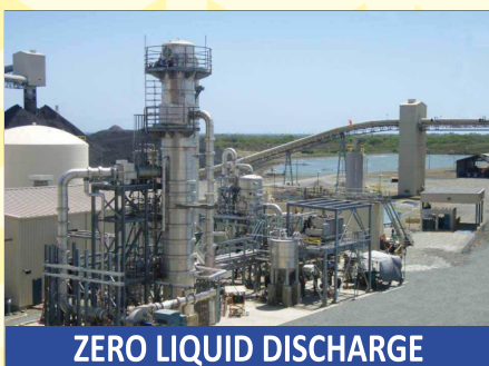
ZERO LIQUID DISCHARGE