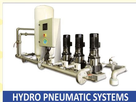
HYDRO PNEUMATIC SYSTEMS