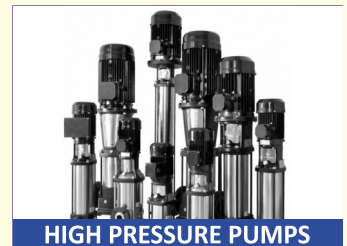
HIGH PRESSURE PUMPS