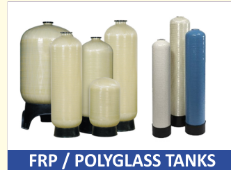
FRP / POLYGLASS TANKS