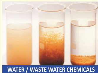
WATER / WASTE WATER CHEMICALS